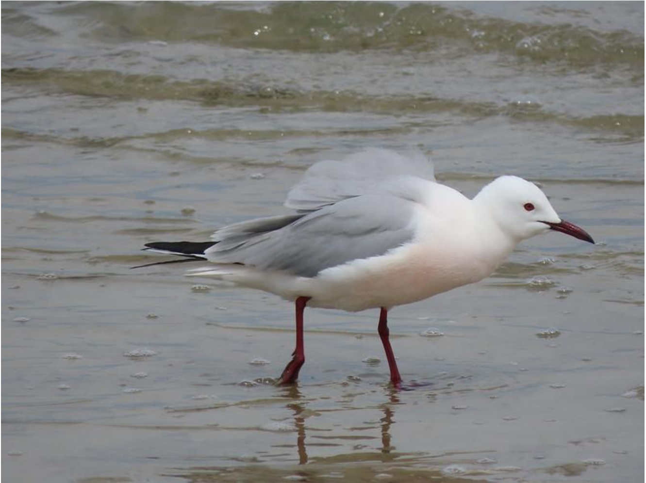
Slender-billed Gull.

April 18, Day 4: The Saturday Market and the Steppes of La Crau. Arles's weekly market stretches for almost a mile and a half up and down the Boulevard des Lices. Olives, mattresses, exotic spices, cheeses, poultry, silk scarves, wines, shellfish, honey, shoes, fruit, soap, sausages, cookies, cakes, and just about every local and regional delicacy imaginable can be found here, right in front of our hotel.