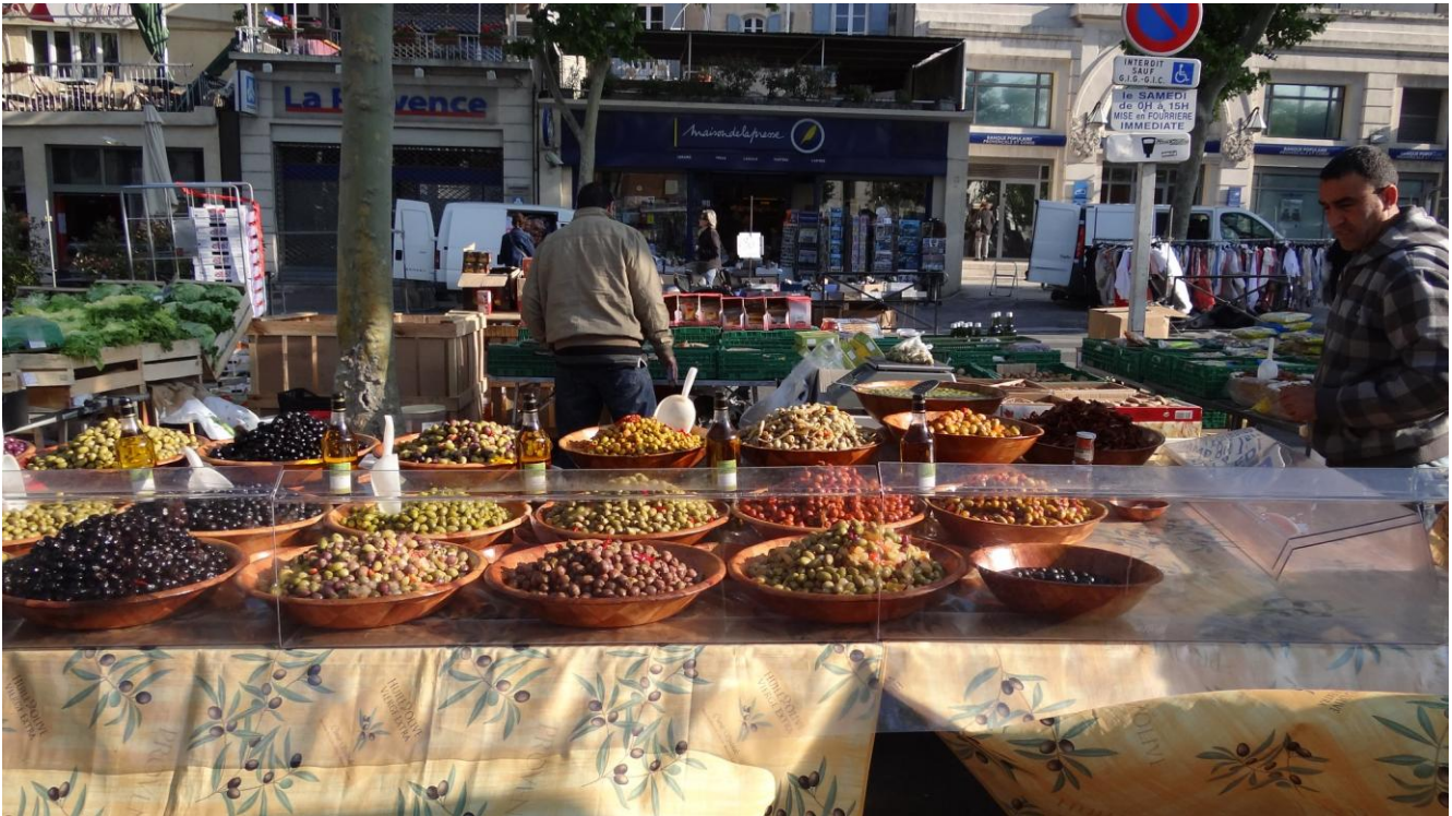
Olives at the Saturday market in Arles.

Sunday, April 19, Day 5: The Petite Camargue and Ancient Arles. The Rhône River and its broad delta dominate the landscape of southern Provence. After breakfast we will make the drive down the western branch of the Rhône to the Petite Camargue, a patchwork of rice paddies, fields, woodlots, and marshes. Among the wide variety of wading and water birds that breed or forage here are Red-crested Pochard, Greater Flamingo, and Whiskered Tern. We will keep an eye on roadside wires and fences for such colorful Mediterranean specialties as Hoopoe, European Bee-eater, and European Roller. This is also the best site in France for that purpliest of purple birds, the huge Western Swamphen.